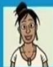
THE 'WHAT'S UP' NOD