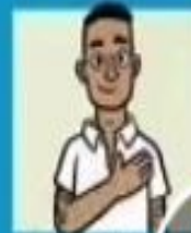
THE HAND ON HEART