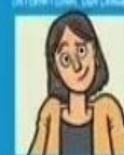
THE 'WHAT A YEAR, HUH?'

ADAPTED FROM #COVID19WATOTL: https://t.co/... 24 June 2020