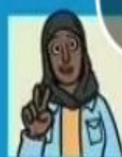
THE PEACE SIGN