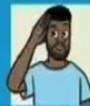
HELLO (INTER-TONAL, SIGN LANGUAGE)