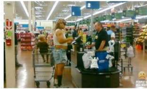
Use of illegal workers