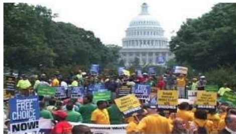
Labor union opposition