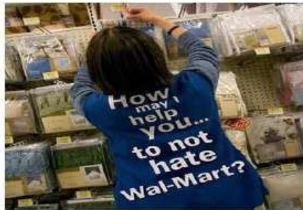
Child labor violations